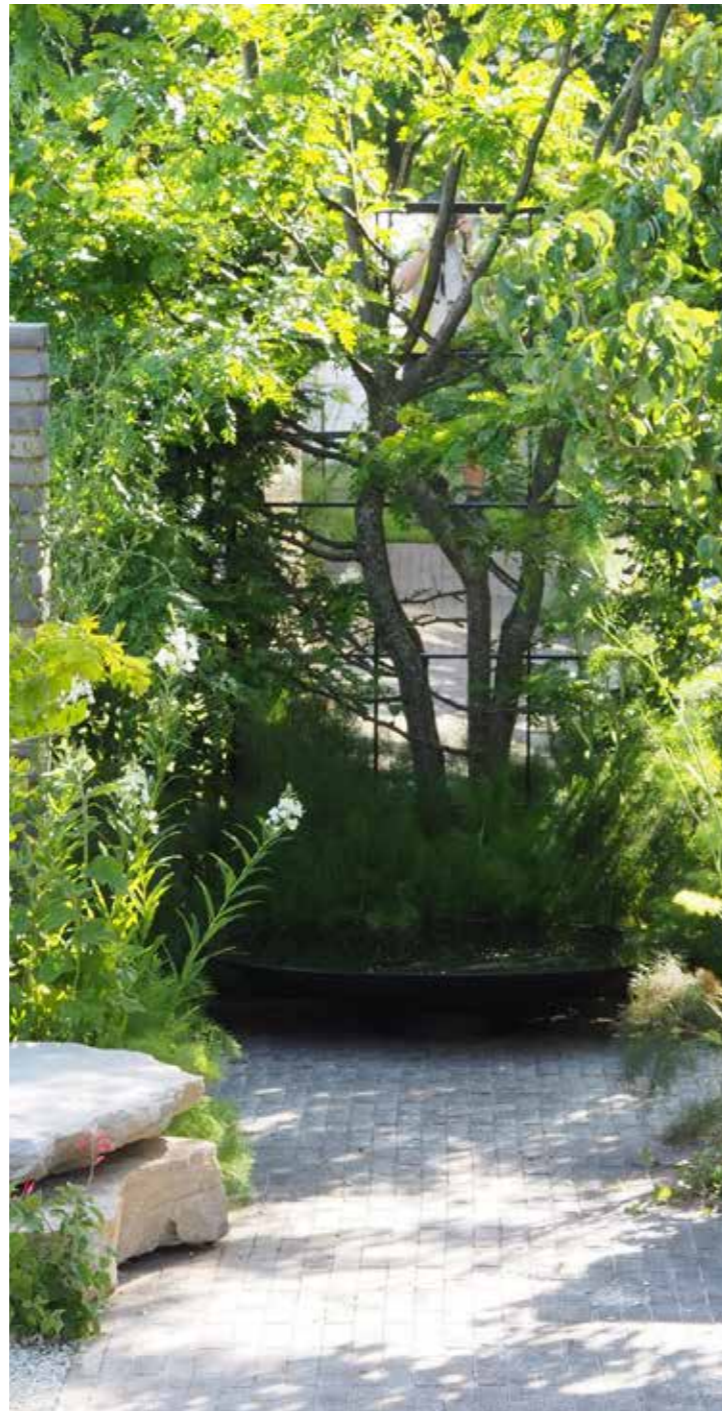
Ula Maria Landscape and Garden Design, Sanctuary Garden Hampton Court

With our relationship with the environment blossoming in the past 18 months, our gardens have worked hard through the summer. Why should the winter be any different? Steering conversations about landscape design towards seasonality acknowledges that we need to look beyond rose-scented summers and appreciate the beauty of winter too. And what better place to admire the cycle of nature than our own backyards?