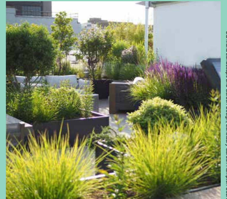
Ula Maria Landscape and Garden Design, Sanctuary Garden Hampton Court