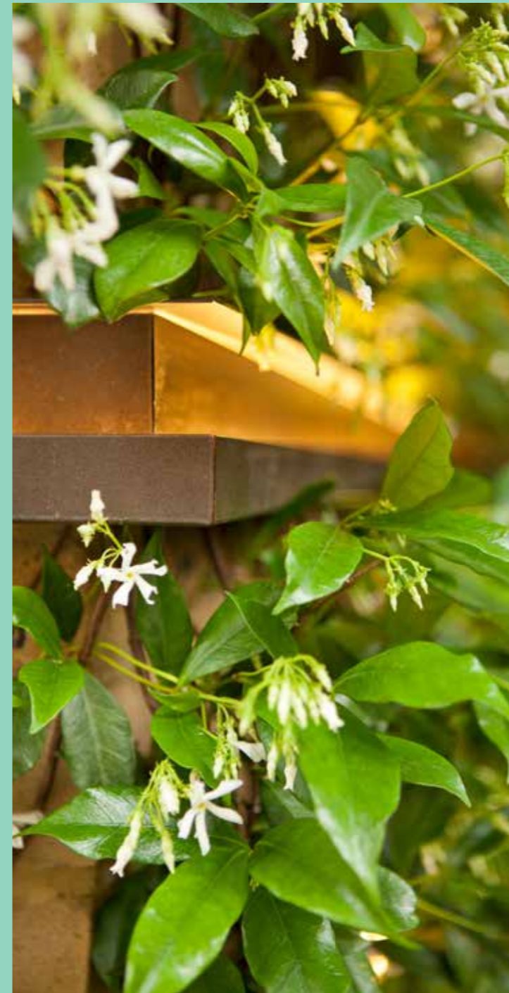
Stefano Marrazz Landscape Architecture, Chelsea Courtyard