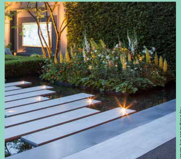
Hay Designs, Eco City Garden