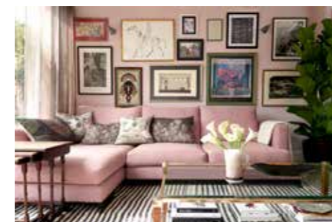
52. Form function feeling

Autumn marks the start of a new chapter. And as we shed summer's skin and retreat indoors for the colder months, our focus shifts to our immediate surroundings, our homes.