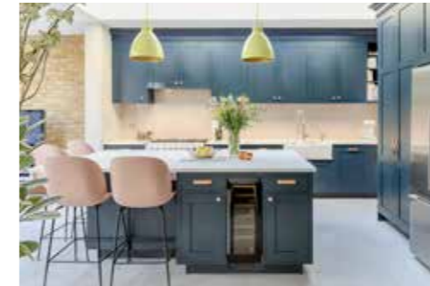
08. Back to the future