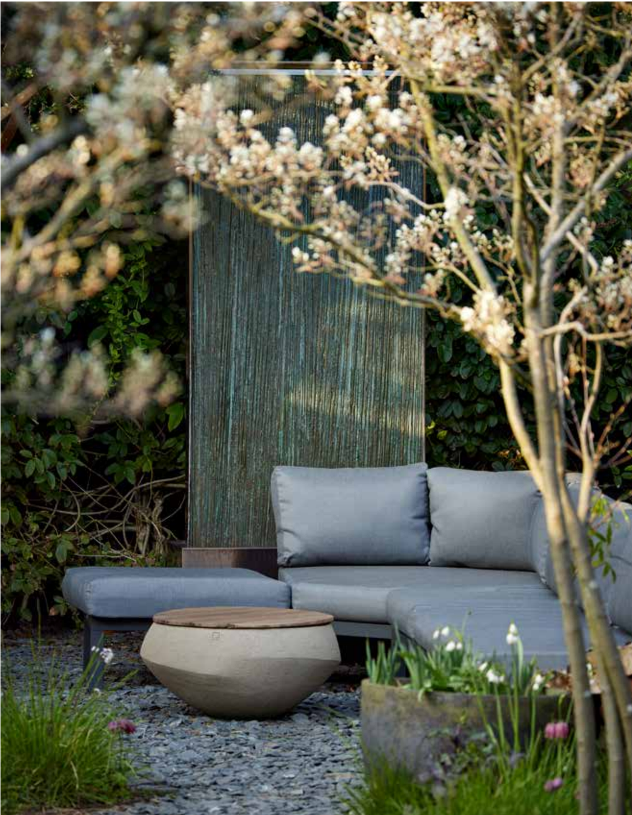
MAGAZINE — SALONE 2022