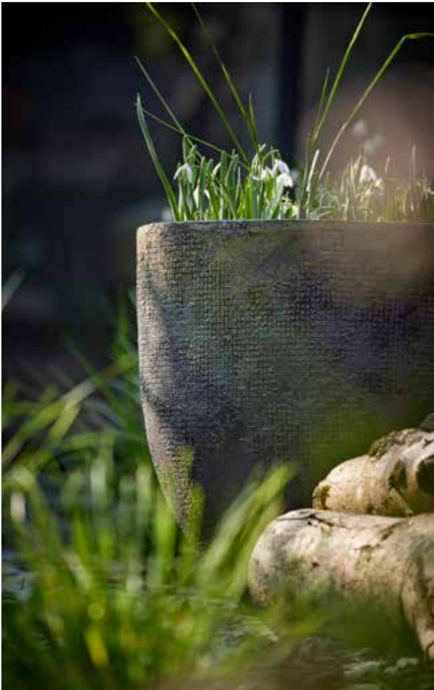
MAGAZINE — SALONE 2022