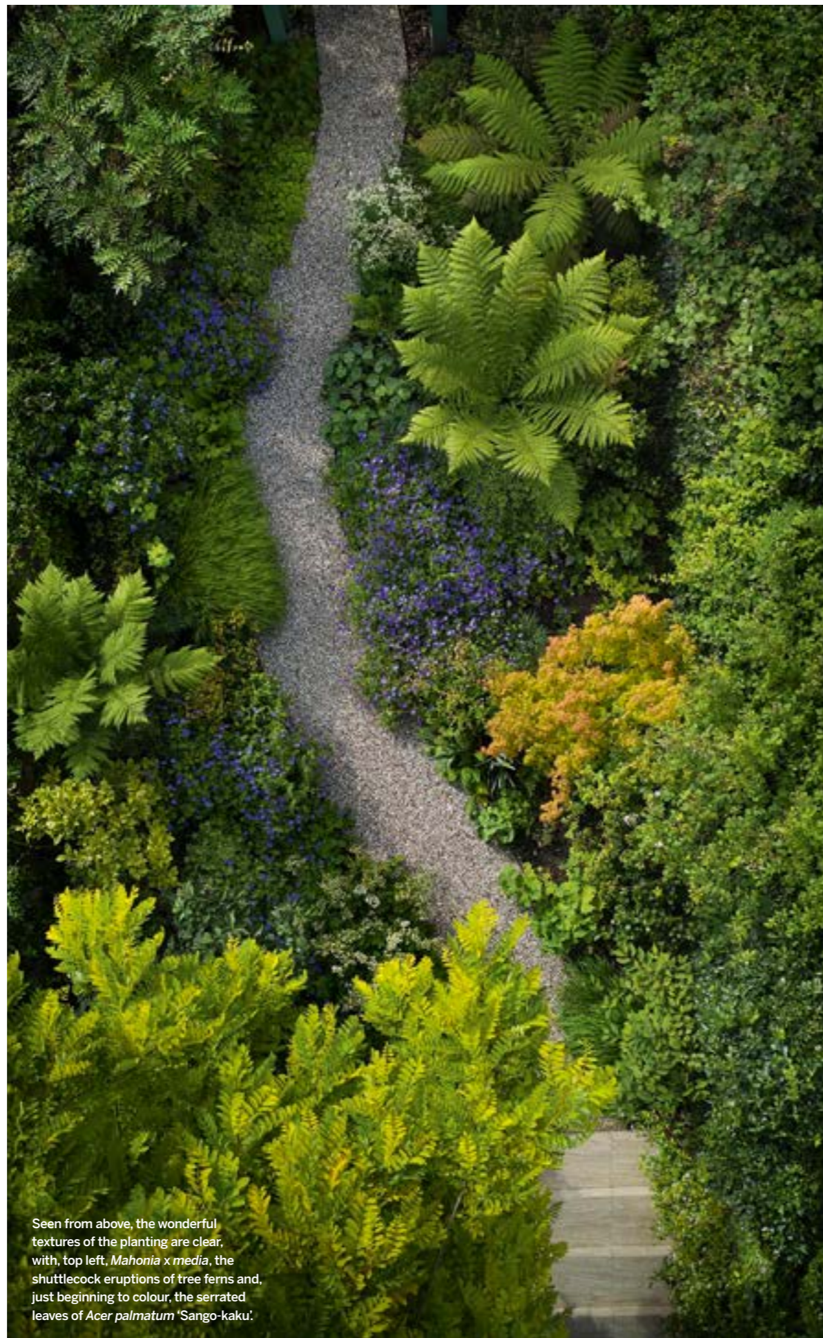
Seen from above, the wonderful textures of the planting are clear, with, top left, Mahonia x media , the shuttlecock eruptions of tree ferns and, just beginning to colour, the serrated leaves of Acer palmatum 'Sango-kaku'.