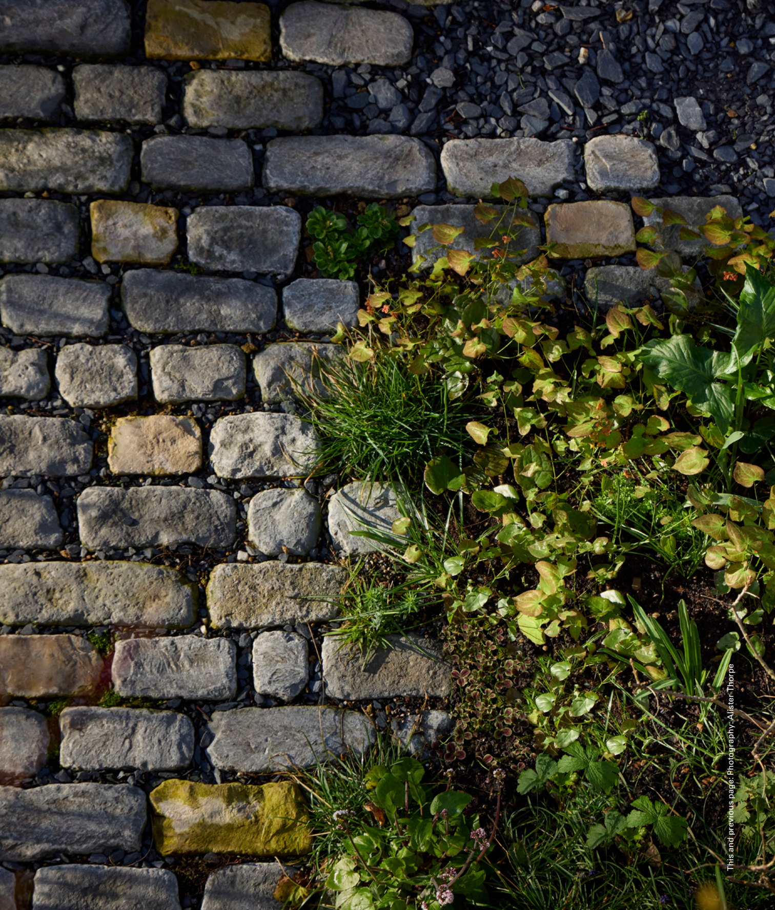
This and previous page: Photography: Alister Thorpe

While kicking off 2025, Atelier Vierkant finds itself in a frontrunning position in the field of inventing and reinventing the ancient art of pottery making. As sole independent family-owned ceramic production in Belgium, we are positioned at an intersection of product development, architecture, interior and landscape design. In February, together with cherished partners, we open our first exhibition space in Cape Town, Ballotina, and we are excited to bring our work to the South African design community as an open invitation to collaborate on future projects. In April, our second production unit close to Brussels will open its doors; our commitment to invest in advanced production facilities remains a top priority. Manual production with assistance of modern mechanical support allows us to generate a unique product. At the yearly design fair in Milan, Salone del Mobile, we will reveal an ‘animistic’ collection of vessels, shapes and volumes, in a setting created under the guidance of architect Dieter Van der Velpen.